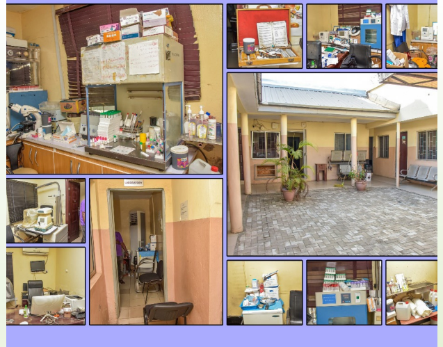
FMW Staff Clinic