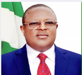
H.E. SEN (ENGR) David Nweze Umahi, CON, FNS, FNATE Honourable Minister of Works

Dear Esteemed Readers, I bring to you, the maiden edition of 'Road Infrastructure e-Newsletter'. This is an innovative monthly online publication of the Federal Ministry of Works. As the premier volume, this will serve as a prelude into showcasing the Ministry's core mandate, which is the provision of critical road infrastructure to Nigerians. In the subsequent editions, readers will be having a peep into efforts being made by the Renewed Hope Administration of His Excellency, President Bola Ahmed Tinubu, GCFR in changing the face of Nigeria's road network.