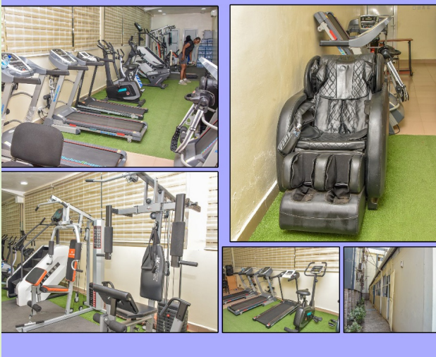
FMW Gym Center