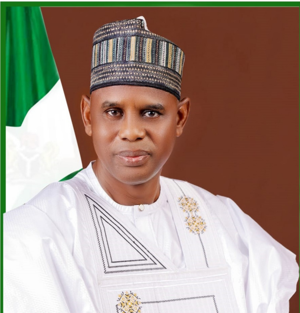
Hon. Bello Muhammad Goronyo, Esq Honourable Minister of State Works