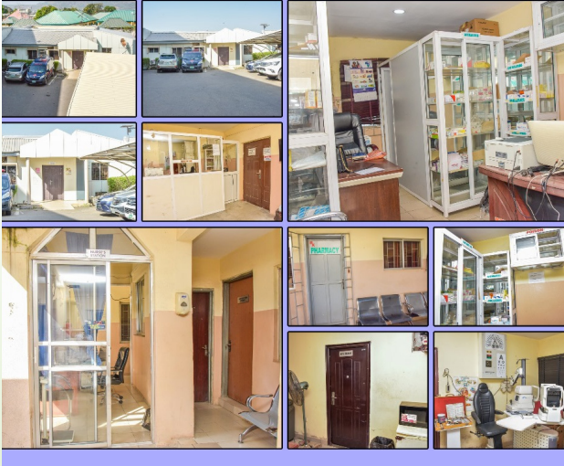
FMW Staff Eye Clinic