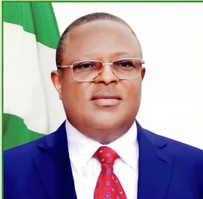
H.E. Sen. (Engr.) David Umahi, CON, FNSE, FNATE Honourable Minister of Works

The Ministry has two Ministers, the Honourable Minister, H.E Sen. (Engr.) David Umahi, CON, FNSE, FNATE and the Honourable Minister of State, Bello Muhammad Goronyo, Esq., while the Permanent Secretary is Engr. Olufunso Adebisi, FNSE.