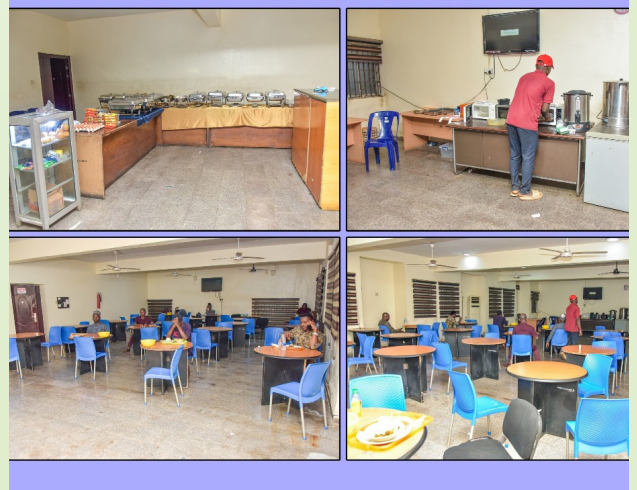
FMW Staff Canteen